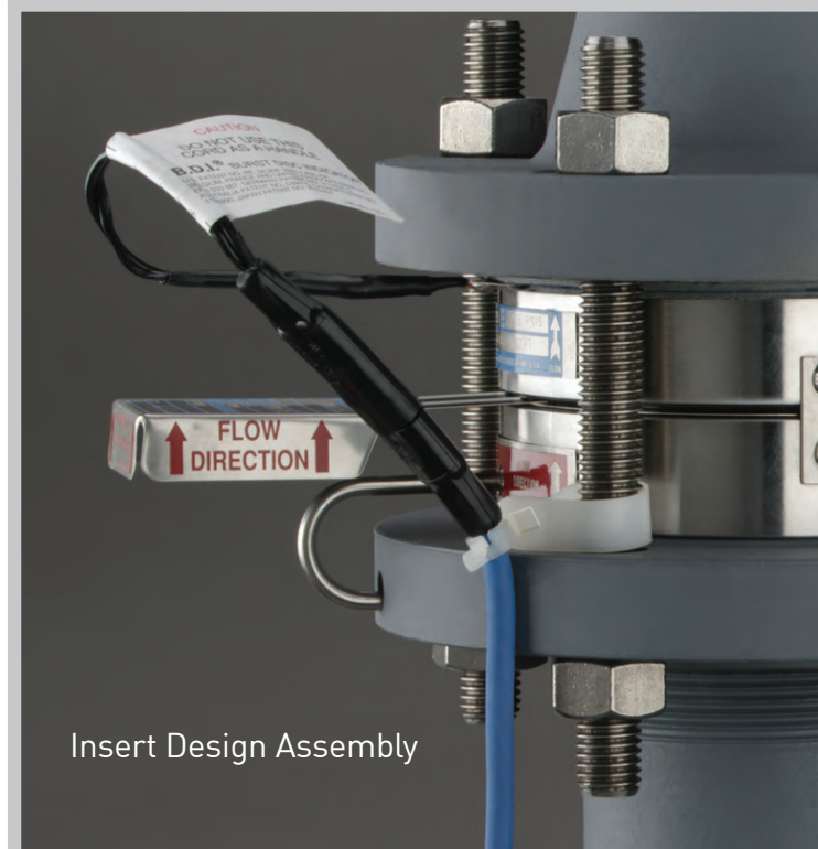
Insert Design Assembly