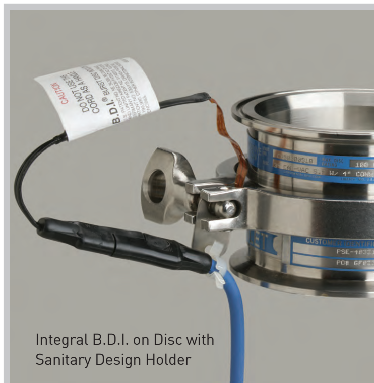
Integral B.D.I. on Disc with Sanitary Design Holder