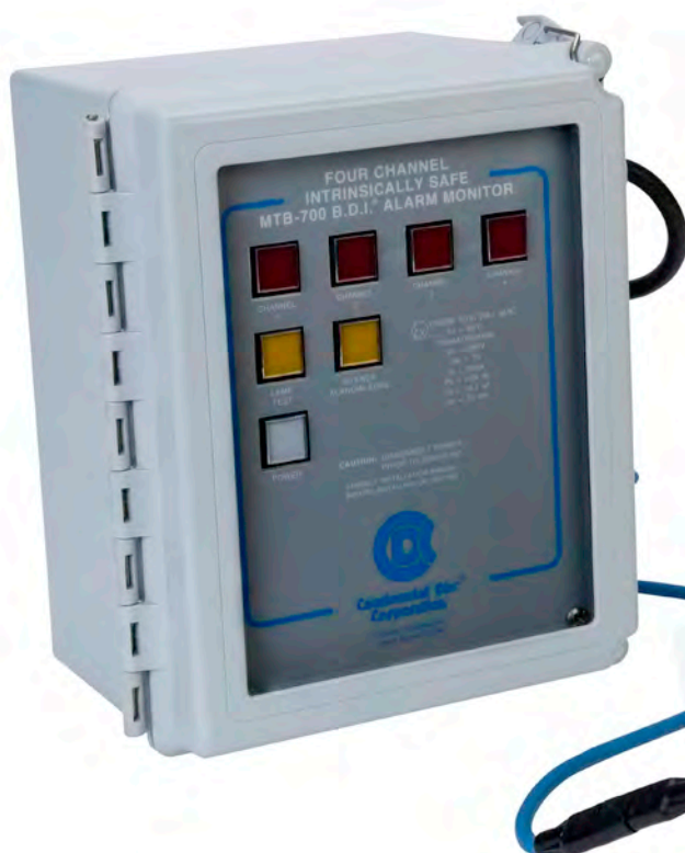
MTB-700 ALARM MONITOR WITH HPX ASSEMBLY AND UNIVERSAL B.D.I.

The MTB-700 Alarm Monitor incorporates intrinsically safe galvanically isolated barriers, approved for use in many countries worldwide. An MTL5018AC barrier is utilized on the MTB-700 Alarm Monitor with a 120/240 VAC input power option. An MTL5018 barrier is utilized on the MTB-700 Alarm Monitor with the 24 VDC input power option. Upon disc rupture, these barriers activate signals and/or output relays to warn operators and actuate pumps, valves, or other equipment connected to the system.